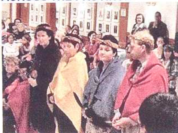
"Honouring our Caregivers of Aboriginal Children" Surrounded by Cedar AGM and Ceremony Victoria, Sept. 2004

Two calls for applications for grant funding were distributed in the Spring and Fall of 2004 resulting in a total of 21 approved grants with $67,000 being awarded to community agencies, support groups and parent groups across the province. Grants aimed at finding permanent placements for children and youth funded a variety of projects across the province from Victoria to Nanaimo, Burnaby to Penticton, and Summerland to Prince George and Pouce Coupe.