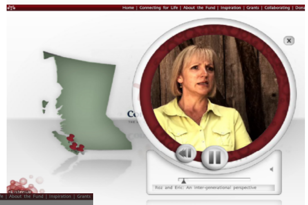
Above: An adoptive Grandparent shares her experience parenting her grandchildren