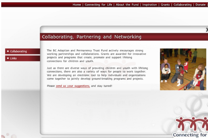
Left: Diversity, shared experiences, collaboration, networking:

www.connectingforlife.ca is a resource and gateway to information for anyone wanting to learn more about adoption and permanency in British Columbia