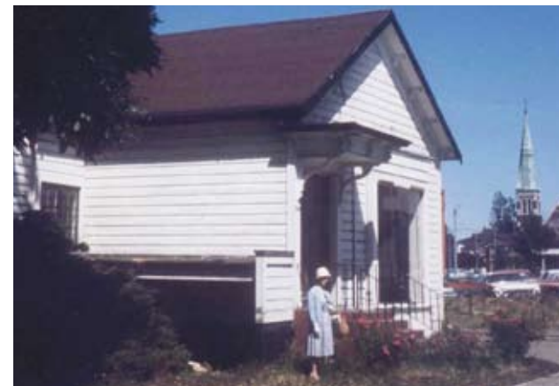
The Sunshine Inn – where it all began and the original Victoria Foundation office. It was also the city's soup kitchen.