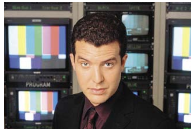
Comedian Rick Mercer will join the Foundation to celebrate 75 years at a special event on June 11.